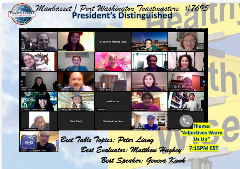
Table Topics: “This or That!”

In 30 seconds or less, members and guests describe themselves with adjectives that begin with the same letters as their first & last initials.