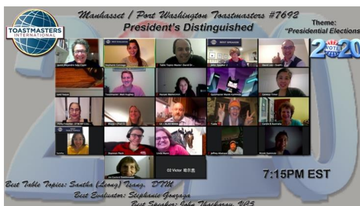
Table Topics: “First-World Problems & Presidential Agendas”

In 30 seconds or less, members and guests recount memories as first time voters.