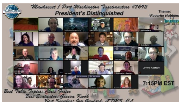
Table Topics: “If THIS Was Your Favorite Hobby”

In 30 seconds or less, members and guests describe their favorite hobbies.