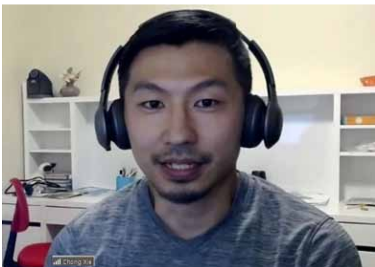
Chong Xie Attack is the best form of defense - spoke for and against